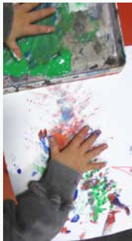
Family Art Lab, DCA