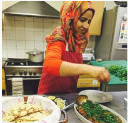
Cooking From Around The World: Indian Banquet

LIMITED SPACES | TO BOOK: fatima@diwc.co.uk | 01382 462 058