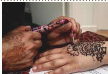
Learn the Art of Henna, DIWC