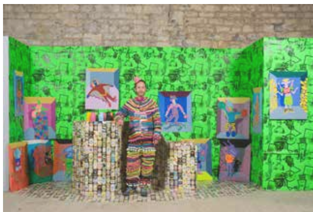
Shonky: The Aesthetics of Awkwardness.

www.dca.org.uk/whats-on/event/Shonky | 01382 423 473