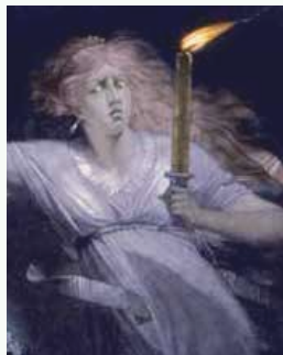
Scotland's Hidden Harlots & Heroines