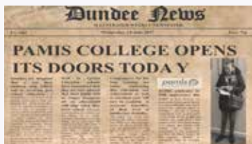
Dare to Dream with PAMIS