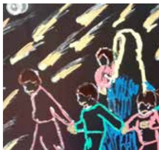
Women and Warfare DIWC's English for Life class, 2017