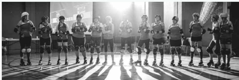
See over for Dundee Roller Girls., Friday 16th.

*Crèche available: £4 per hour (must be booked in advance)