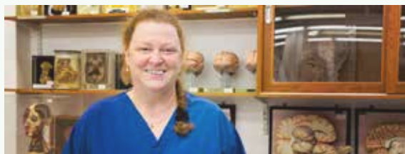
Professor. Dame Sue Black, The ABC of CAHID

( SEWING* 1.00pm - 3.00pm | 18 | £5 See page 8 for details