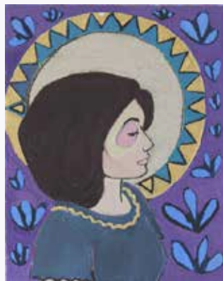
Moonlight, 2016, Nicola Wiltshire

SEWING* 1.00pm - 3.00pm | 18 | £5 See page 8 for details