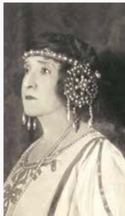
Dame Nellie Melba c. 1924

DUNDEE WOMEN'S TRAIL 1.00pm - 2.30pm | 36 | FREE See page 5 for details